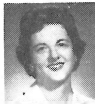
HOME ECONOMIST Eastern District